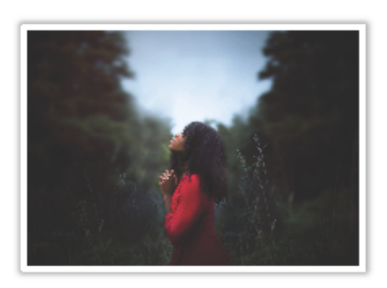
Grow deeper in faith

Feedback: we love hearing from our students see some of their feedback overleaf!