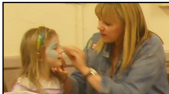
Snap from a most enjoyable day: family activities in the park and community centre, hymns in the pub.