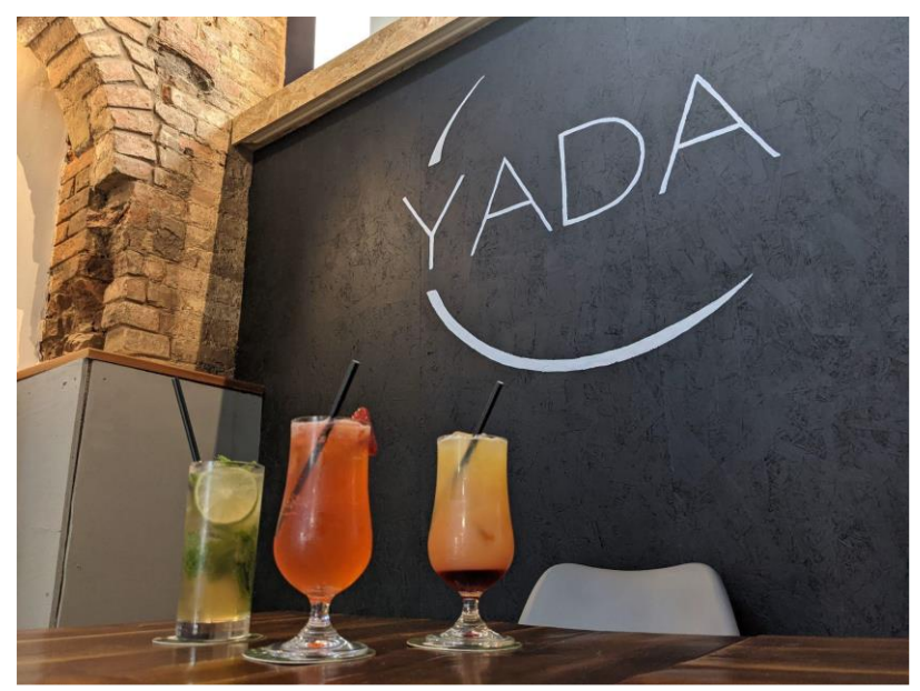
Pictured are three of YADA's creative alcohol-free cocktails. Drinks that use alcohol-free spirits in place of their alcoholic counterparts to keep the taste, but without the headaches.

In the future, the directors hope to have branches of YADA's bar across the whole of the UK, providing alcohol-free alternatives for the wider community of non-drinkers. For more information on the game-changing bar visit <a href="https://yadacollective.co.uk/">https://yadacollective.co.uk/</a> Follow @YADACollective on social media to stay updated on future events and projects or drop us an email if you want to get involved <a href="https://wadacollective.co.uk">hello@vadacollective.co.uk</a>.