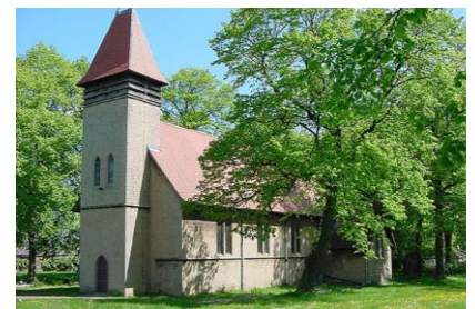
St Luke's Whaley Thorns