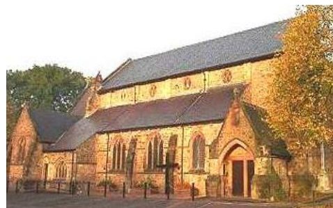
St Thomas Somercotes