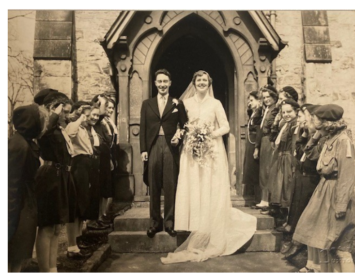
My in-laws married at St James in April 1953