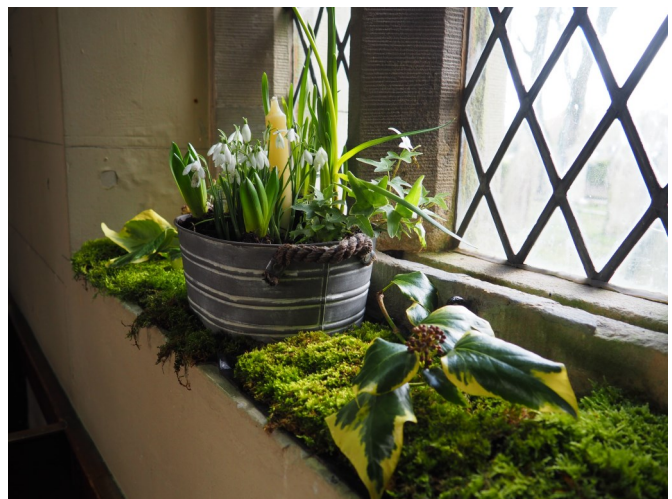
First Snowdrop Festival