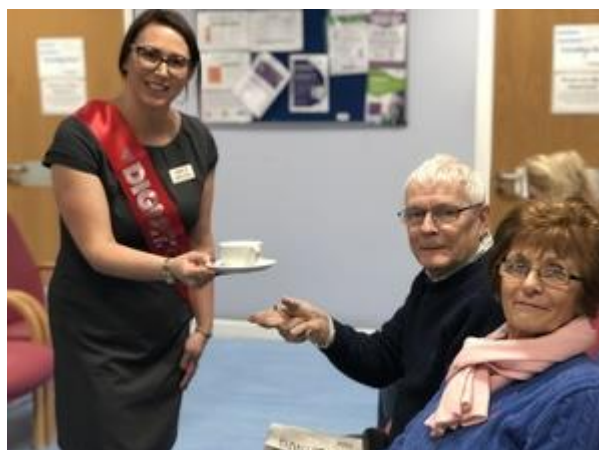
Visitors receiving a brew and a smile at Barlborough NHS Treatment Centre.