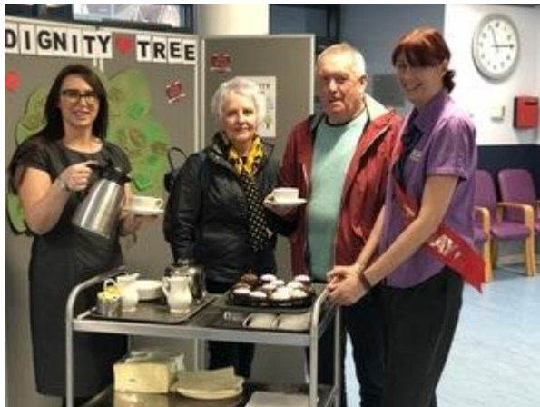
A brew and cakes on offer at Barlborough NHS Treatment Centre on Dignity Action Day.