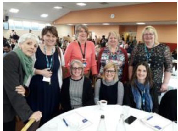
The DCHS team at the conference.