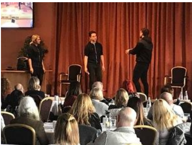
Alter Ego performing their drama about County Lines.