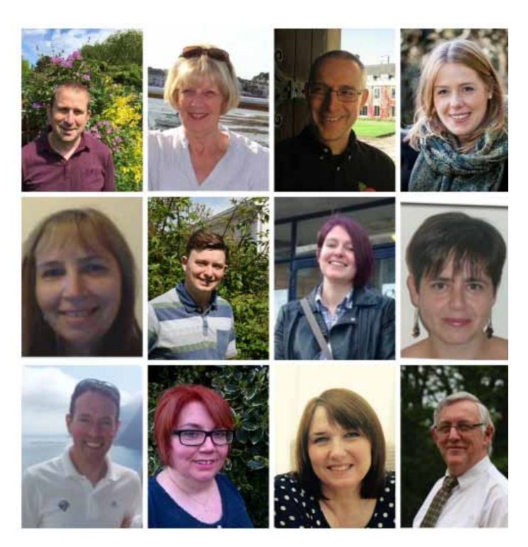
Some of those ordained in the diocese during Petertide 2015

A key priority for the Diocese is to seek to increase the number of vocations for both ordained and lay ministry, an increase in the number of people who are being called to this ministry and with a particular