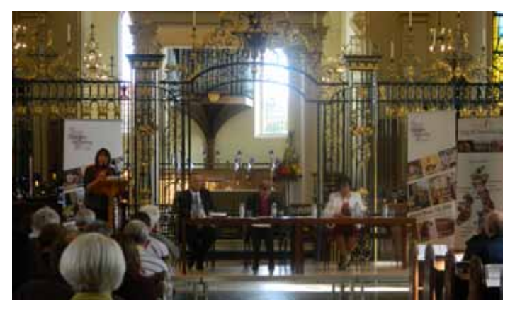
Migration Summit with Bishop Alastair

The Bishop hosted the Chesterfield Modern Slavery Conference at Danesmoor in December which was very well attended.