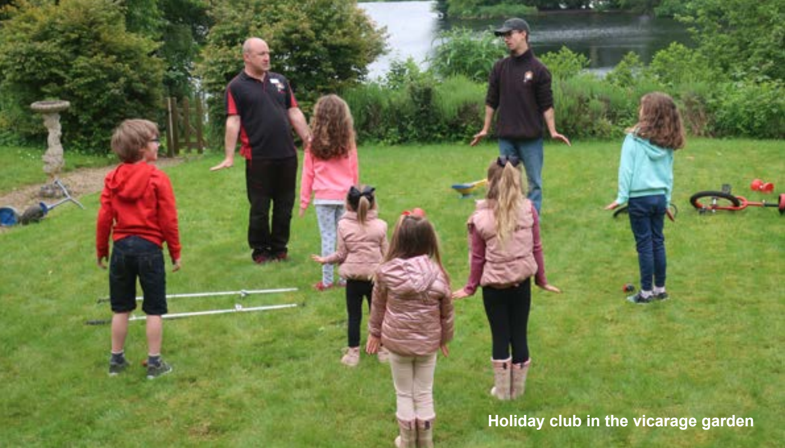
Holiday club in the vicarage garden