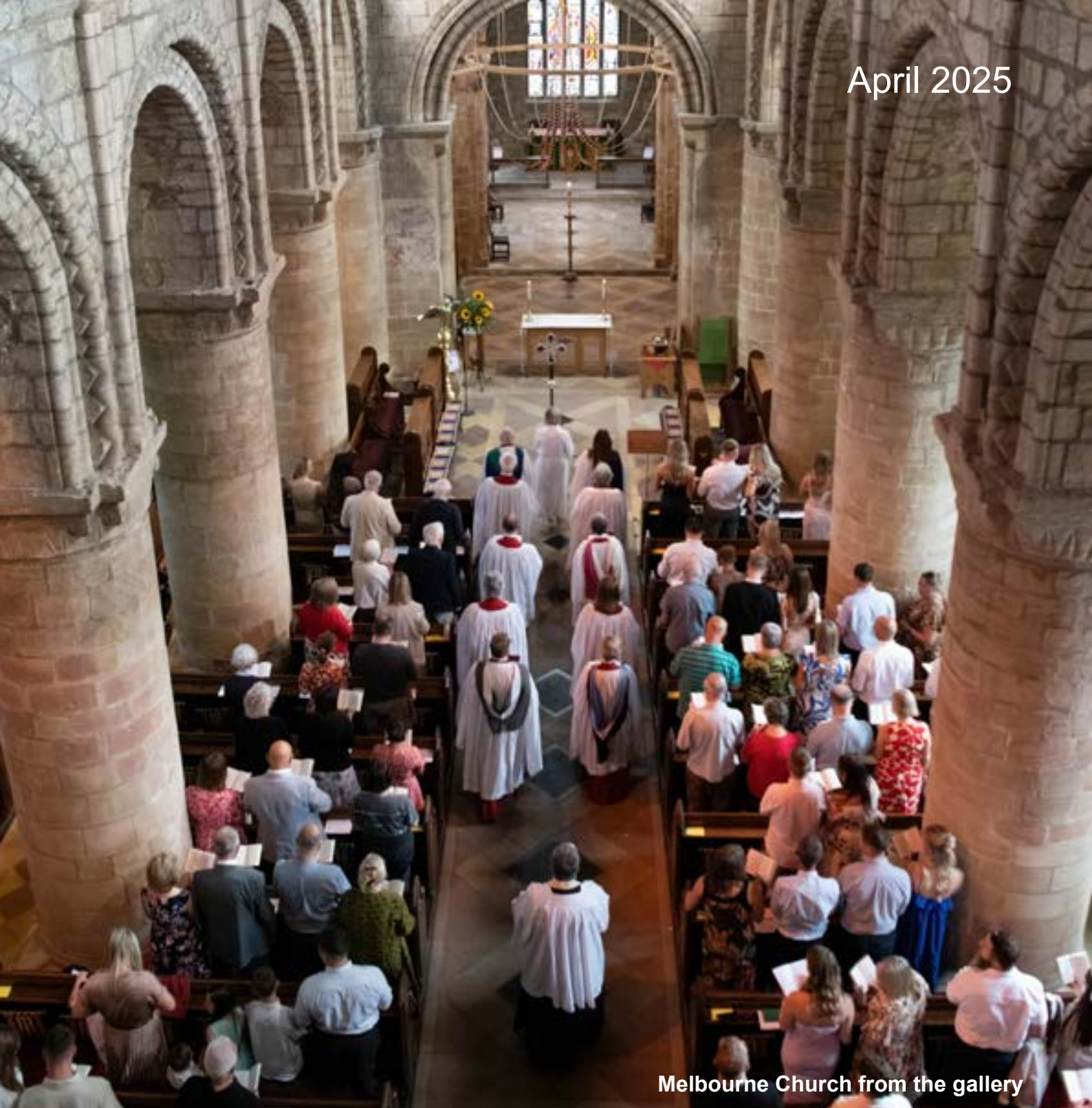
Melbourn Church from the gallery