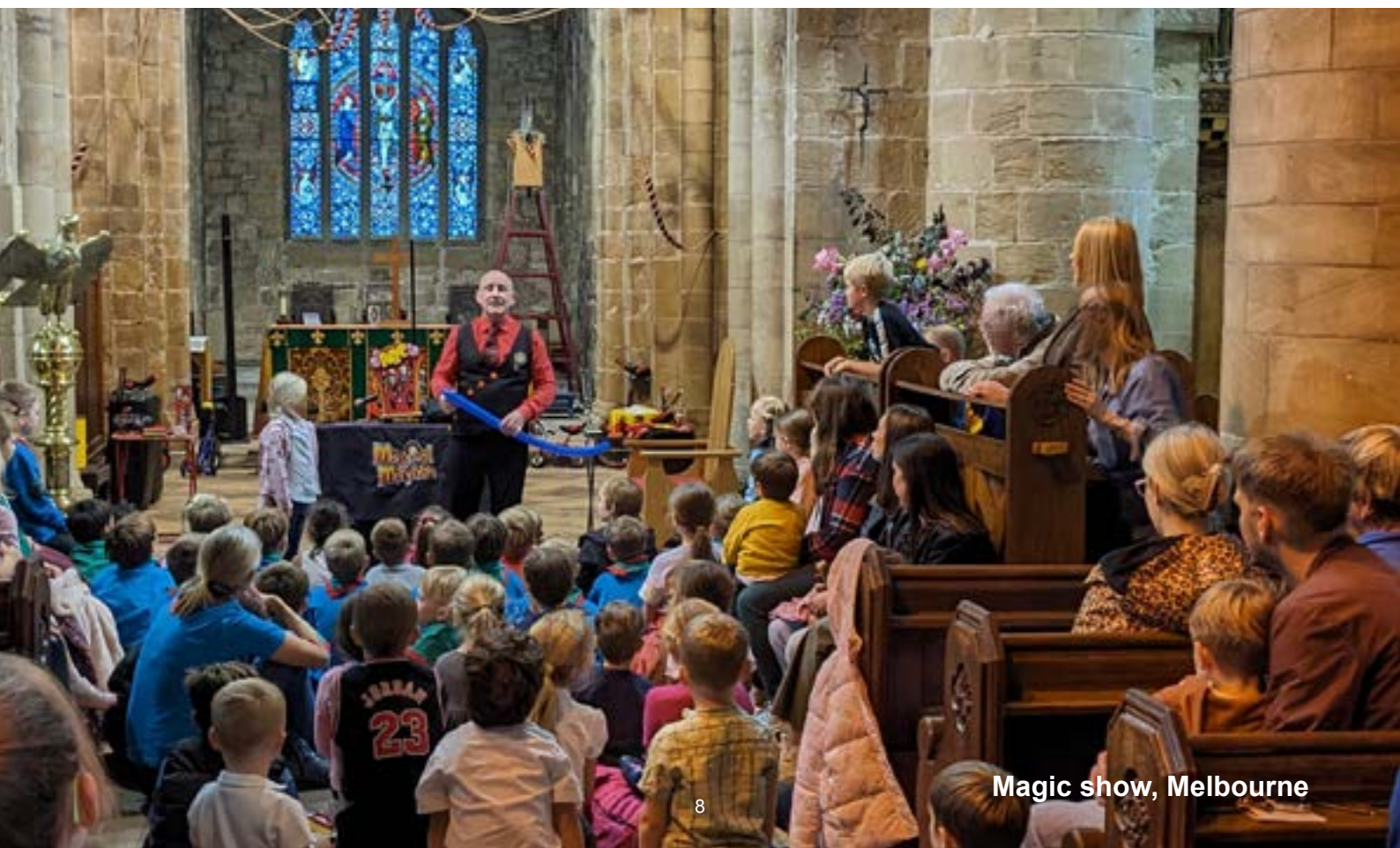
Magic show, Melbourne

visitpeakdistrict.com/events/melbourne-fete-carnival