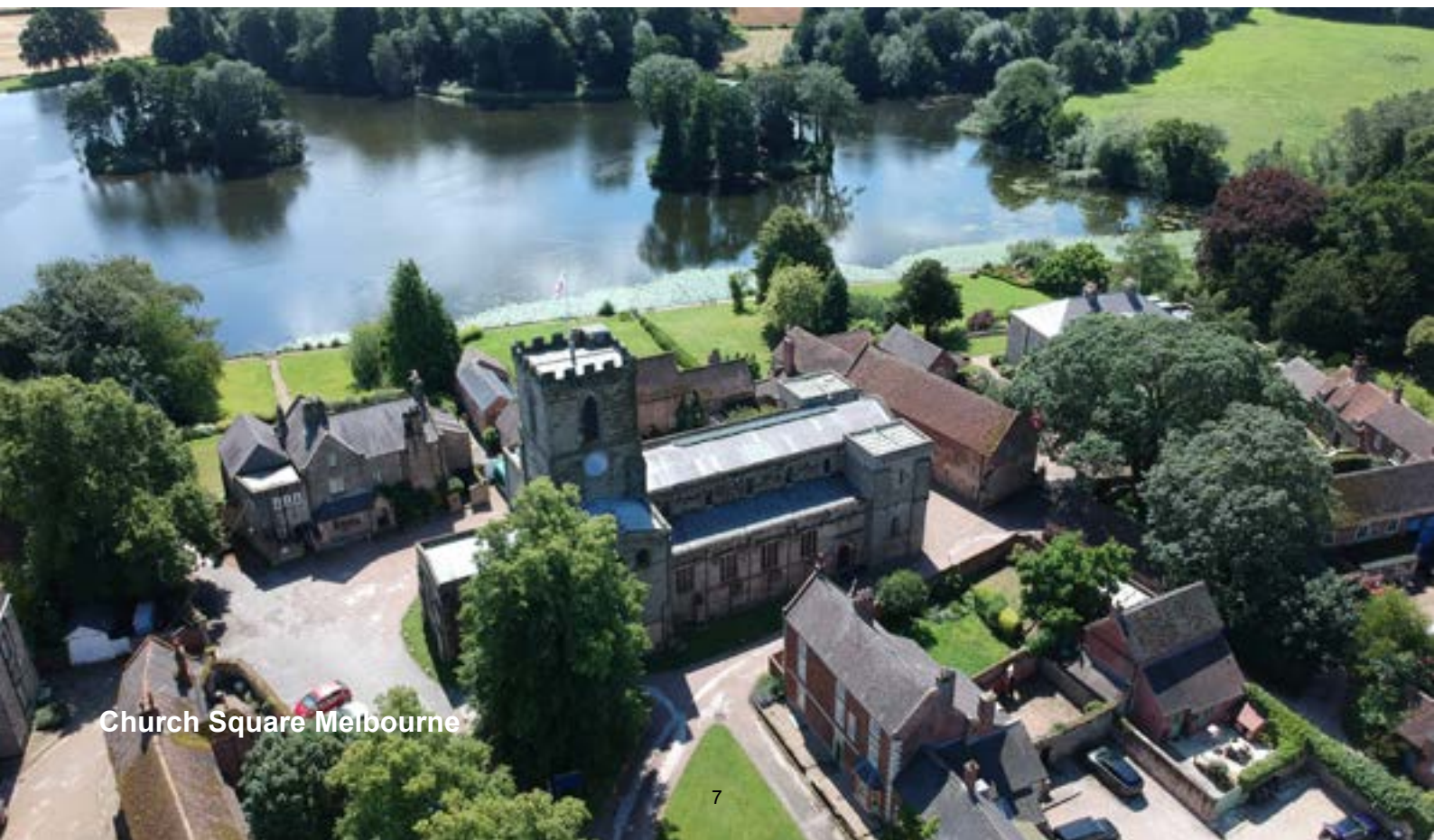
Church Square Melbourne

From year 7 most Melbourne, Stanton and Ticknall children attend Chellaston Academy on the southern outskirts of Derby ( http://www.chellaston.derby.sch.uk ), also rated as "Good" by Ofsted. Buses transport the children to and from the school. There are fee-paying schools in Derby, Loughborough and Repton.